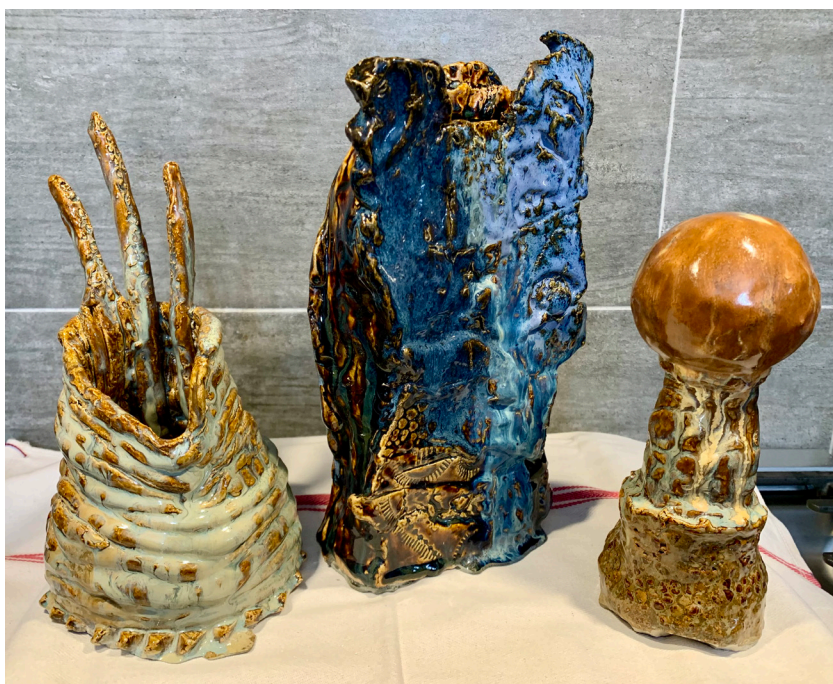
Paul Mishler’s “The Three Faces of Infinitae Fortitudinis” Kiln fired ceramic sculptures with various glazes.